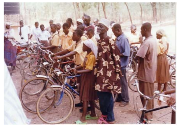
A lineup of beneficiaries