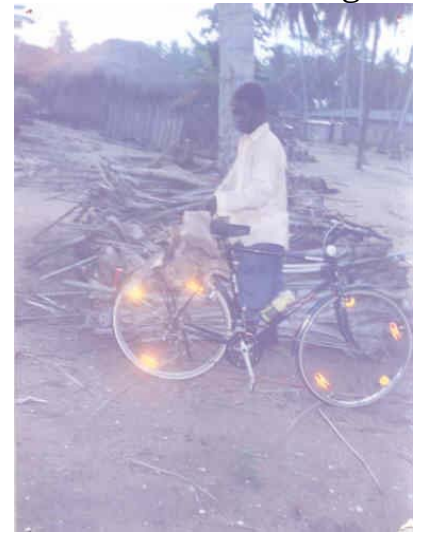
farmer louding firewood on the bike

transportation. With the provision of the bicycles, carrying out their educational programmes in the communities will be made easy. The bicycles, through this organization will be donated to need children who will have to walk long distance to get to school.