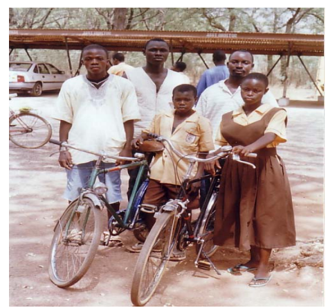
two beneficiaries with guardians