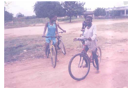
young needy children with their bikes

❖ The Tafi-Adome Monkey Sanctuary (Eco-tourism) received 20 bicycles for renting to tourist who visit the site.