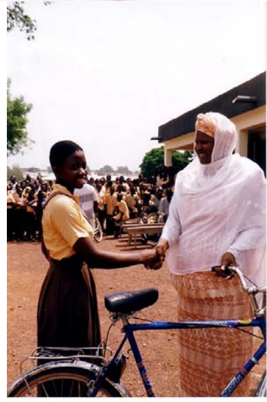
A line up of school childrenbeneficiaries with their bicycles

a youth receiving her bicycle with smiles