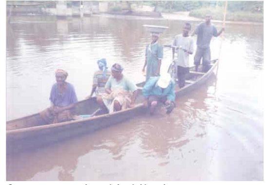
farmer carrying his bike in a canoe to get to farmer