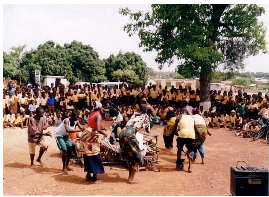
A display of traditional dancers of Sawla-Tuna-Kalba district during presentation of bicycles to poor needy children to help them go to school.