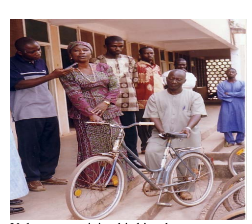
Volunteer receiving his bicycle

Action For Needy Children And Women Development (ANCWD) was presented with 30 bicycles to assist in the communal activities. Out of this number 20 bicycles were presented to volunteers to enable them carry out awareness programs on HIV/AIDS and distribution of condoms in the districts.