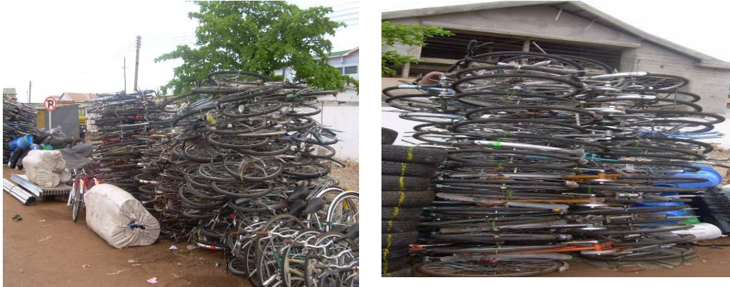
Bicycles for distribution in the Northern Region

The 500 bicycles allocated to the Northern region were distributed by Pro-link’s partner: Northern Sector Action On Awareness Center (NORSAAC). The beneficiaries were mostly school- going children and women groups to encourage regularity and punctuality in school, reducing walking fatigue, saving time and energy for other productive work. The distribution is as follows: