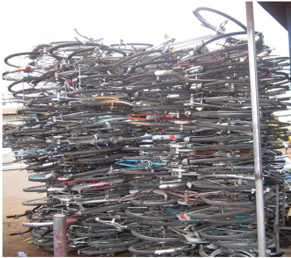
Bicycles for distribution in the Volta Region for street youth and community volunteers

Some people living with HIV/AIDS and orphans have been identified in the Kpoeta community. As a means of giving hope to these orphans and vulnerable children who are in school, 70 bicycles were given to them to encourage regularity and punctuality in school. The distribution took place in the presence of family heads because the mode of distribution was according to households. This mode of distribution was adopted so that as many children as possible could have access to the bicycles or do so in turns.