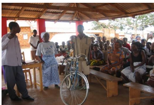
Outstanding volunteers receiving bicycles from Pro-link

Pro-link's office in Mankessim distributed 60 bicycles to hardworking peer educators to facilitate their movement to the communities.