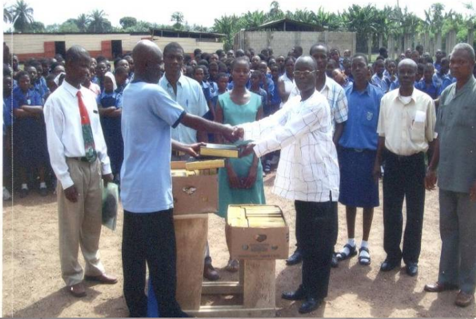
Head Master of Likpe High School receiving the books being presented by the Project manager in Hohoe on behalf of the students