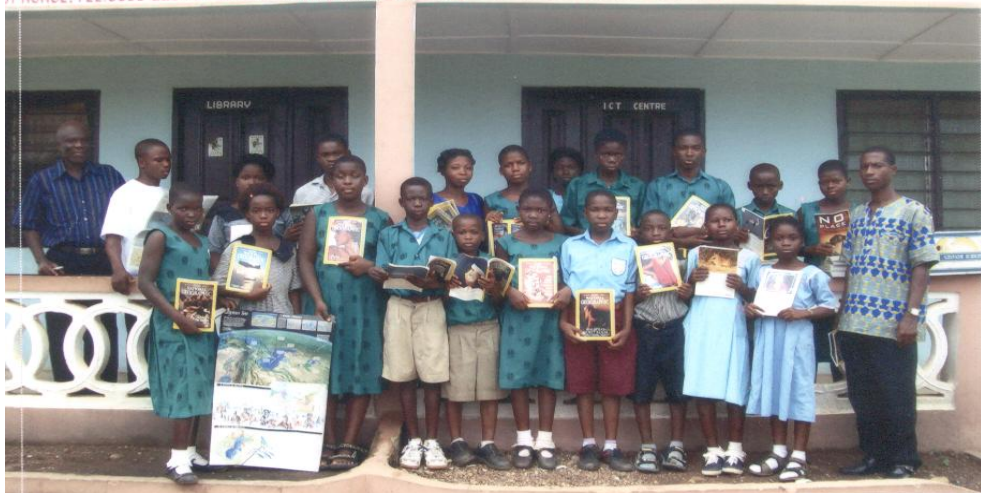
Some Student beneficiaries showing the books they have received from Pro-link after the presentation

PRO-LINK INTEGRATED RESOURCE CENTRE 11 HONOE, TEL. 0935-22886 WEBSITE: WWW.prolinkghana.org E-mail: info@prolinkghana.org