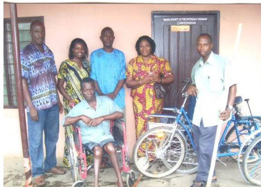
The executive director and staff of Prolink after donation of tricycles to a representative of GSPC.