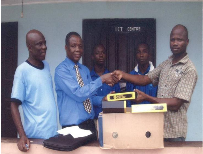
Head master of Gbi High school receiving the books from a field officer in Hohoe.

PRO-LINK INTEGRATED RESOURCE CENTRE 11 HONOE, TEL. 0935-22886 WEBSITE: WWW.prolinkghana.org E-mail: info@prolinkghana.org