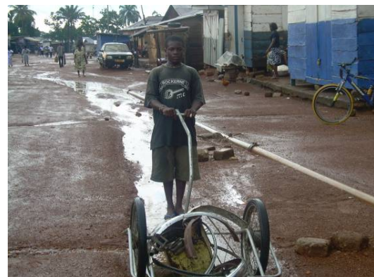
Push carts for street youth