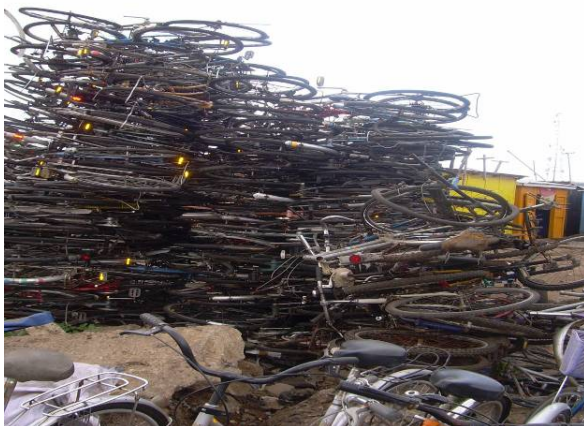
Bicycles for Distributed to Peer educators and community volunteers in Obuasi