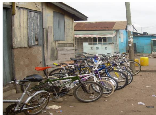
Bicycles to be presented to peer educators in Pomposo